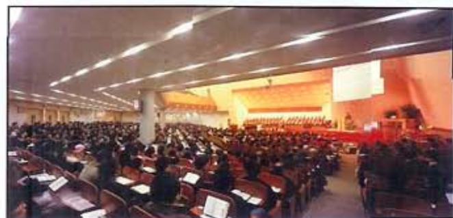
The hall before the new sound system installation.