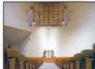
The final SpekTrix installation.

SpekTrix boxes were aimed at the second floor and a SpekTrix Sub was set to avoid direct reflection from the balcony. Below the woofer, four further SpekTrix boxes were aligned to cover first floor