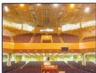
The church's interior space.