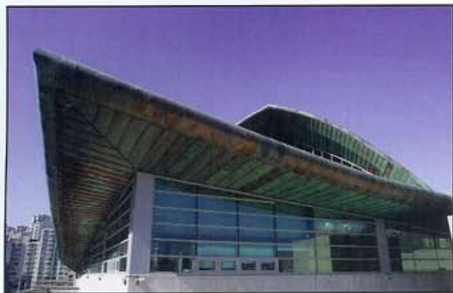
The award-winning architecture of Seoul's Moohak Presbyterian Church.