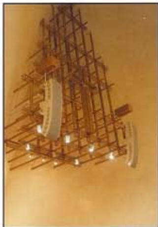
Adamson SpekTrix system rigged for demonstration.

SpekTrix boxes were aimed at the second floor and a SpekTrix Sub was set to avoid direct reflection from the balcony. Below the woofer, four further SpekTrix boxes were aligned to cover first floor