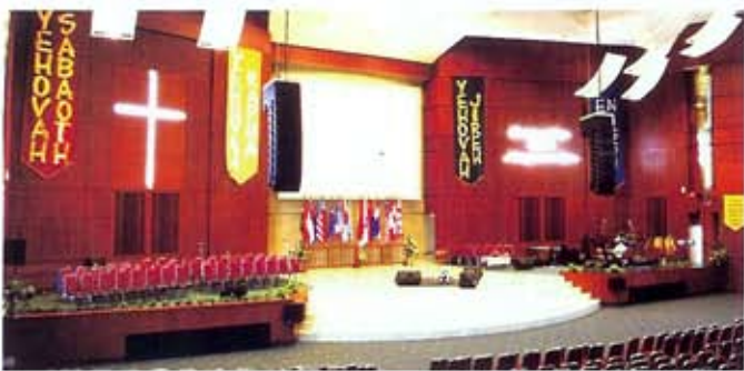
The Gereja Sidang Jemaat Allah Betlehem, with Adamson sound system.

The installation design features two single fly-point arrays on the left-hand and right-hand sides of the stage. Each array consists of eight Adamson SpekTrix three-way, 5° true line source array cabinets, with a single SpekTrix sub flown above them to attain bass coverage for the balcony seating area, as well as two 15° SpekTrix Waves in the bottom of each array for extreme down fills. The additional Subwoofer array consists of two clusters of three Adamson Y10 Subs, placed each side and under the stage. Four Vieta Professional VT8i full range-speaker cabinets are deployed for 'lip-fills' to adequately address the