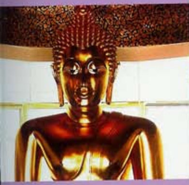
LISTEN WITH BUDDHA SOUND FOR THE PALALEI TEMPLE