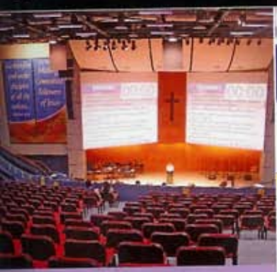
MANILA'S MAIN MISSION NEW HOME FOR CCF HQ