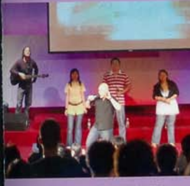
REBUILDING FOR WORSHIP SINGAPORE'S CORNERSTONE