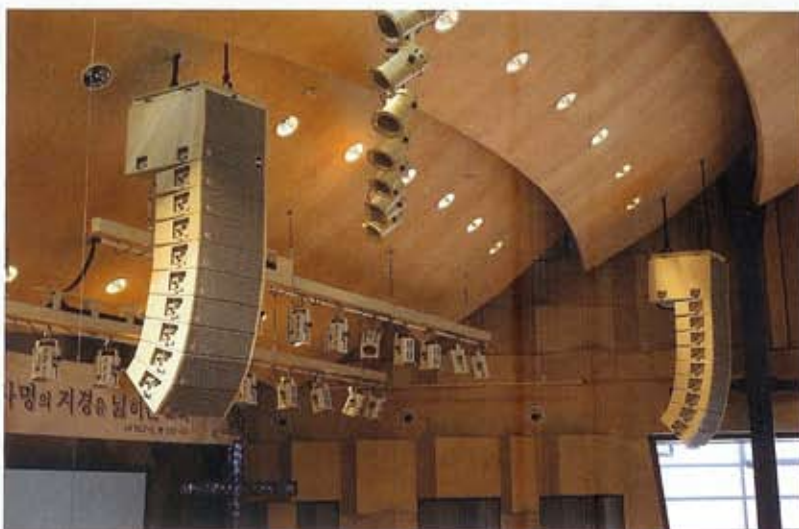
The Adamson SpekTriX line source array system