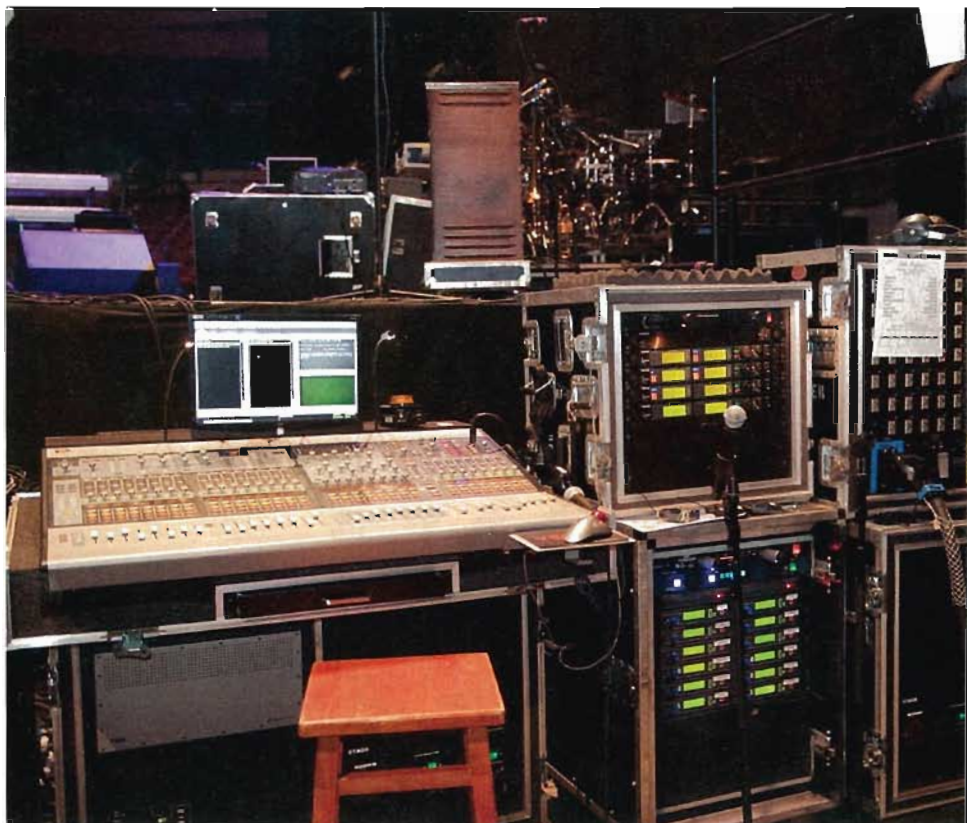
Monitor World, featuring a Digidesign Profile console and Sennheiser and Shure wireless systems.