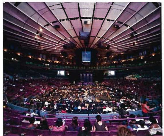
Perspective of Madison Square Garden on the night of Legend's performance.