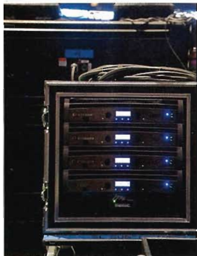
A portion of the system's 64 Crown I-Tech HD power amplifiers.