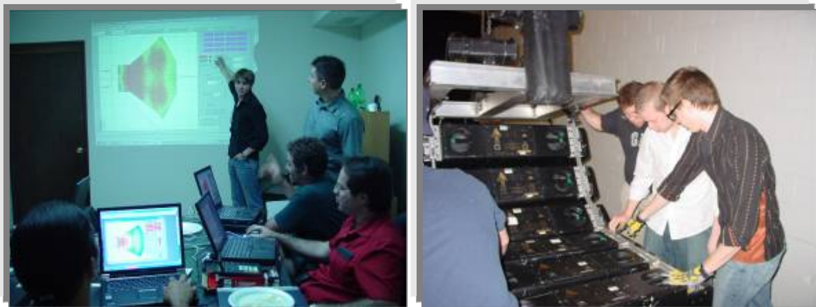
Hands-on Shooter® Software and Rigging Training

To properly represent and safely operate Y-Axis, SpekTrix and Metrix line array systems, any company that wishes to purchase and/or operate Adamson Y-Axis, SpekTrix and Metrix product is required to attend the Adamson training seminar prior to employing the product in the marketplace.